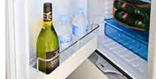
Vivamus accumsan mollis elit