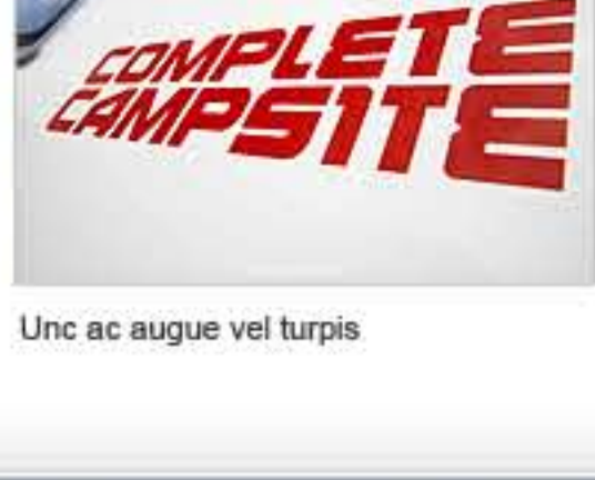
Unc ac augue vel turpis