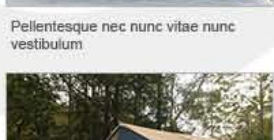
Pellentesque nec nunc vitae nunc vestibulum