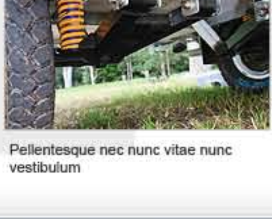
Pellentesque nec nunc vitae nunc vestibulum