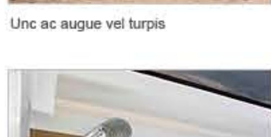
Unc ac augue vel turpis