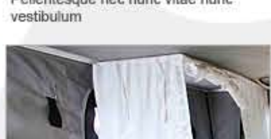
Pellentesque nec nunc vitae nunc vestibulum