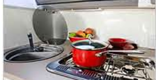
Pellentesque nec nunc vitae nunc vestibulum