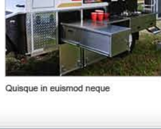
Quisque in euismod neque

painters, electricians, sewers and production-line craftsmen who are working together in our new premises at West Gosford. (You're always welcome to come and visit us!) It's the quality of their work that enables us to offer you the rock solid guarantee of a three-year warranty.