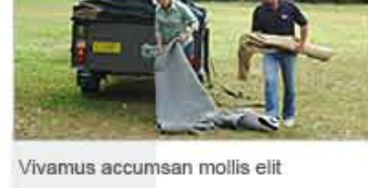
Vivamus accumsan mollis elit