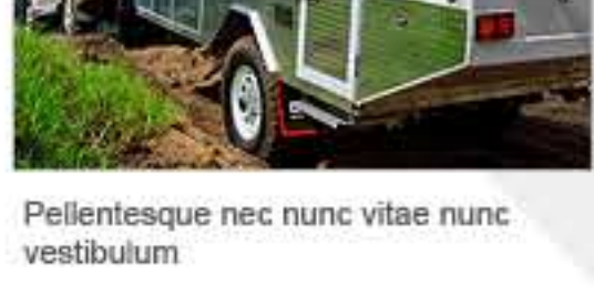
Pellentesque nec nunc vitae nunc vestibulum