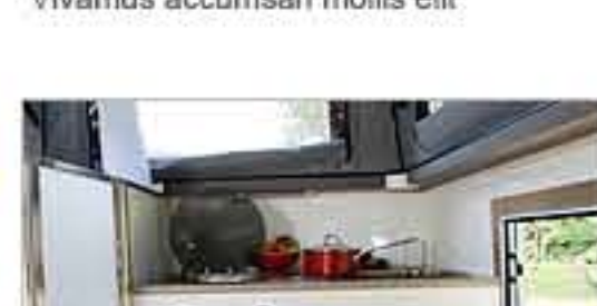
Vivamus accumsan mollis elit