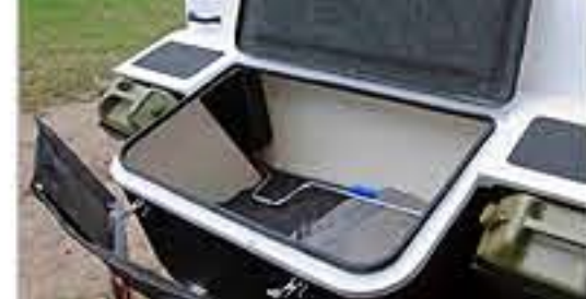
Unc ac augue vel turpis