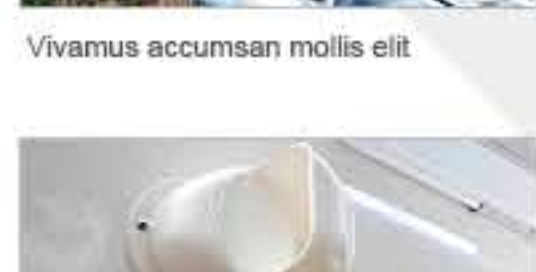
Vivamus accumsan mollis elit