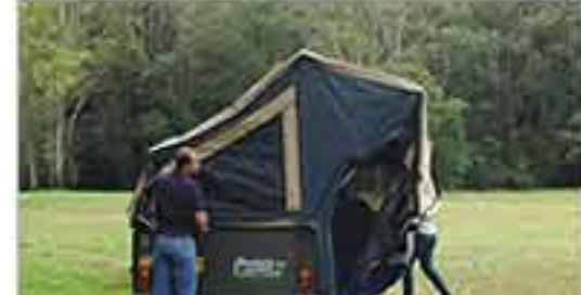
Unc ac augue vel turpis