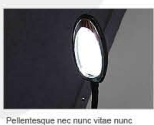
Pellentesque nec nunc vitae nunc vestibulum