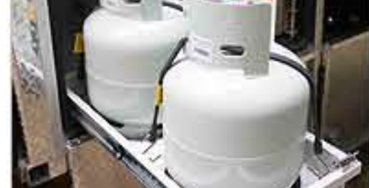
Unc ac augue vel turpis