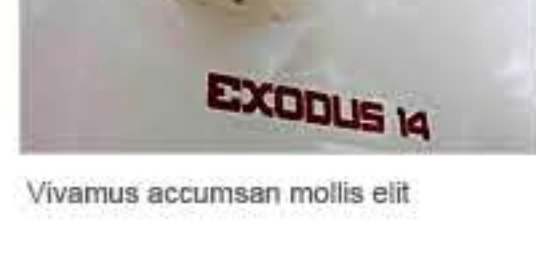
Vivamus accumsan mollis elit