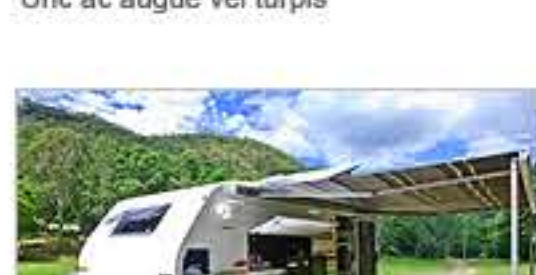
Unc ac augue vel turpis