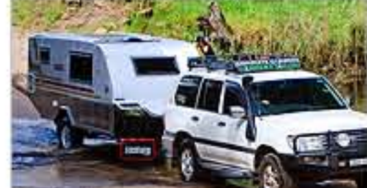
Unc ac augue vel turpis

Some of these photographs have been provided by our more intrepid clients and we invite you to submit shots of your own holiday adventures.