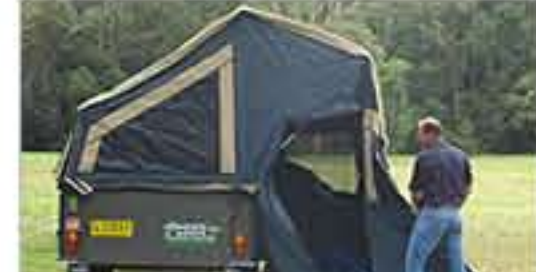
Vivamus accumsan mollis elit