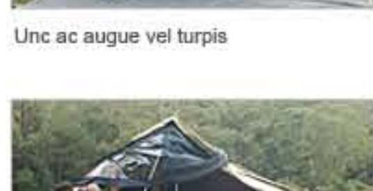
Unc ac augue vel turpis