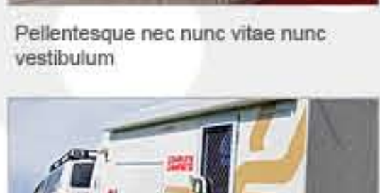
Pellentesque nec nunc vitae nunc vestibulum