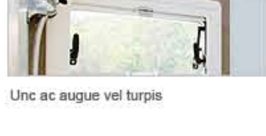
Unc ac augue vel turpis