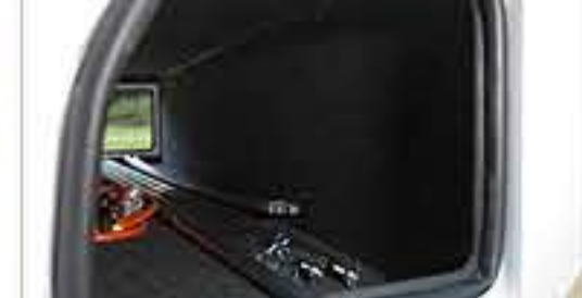
Vivamus accumsan mollis elit