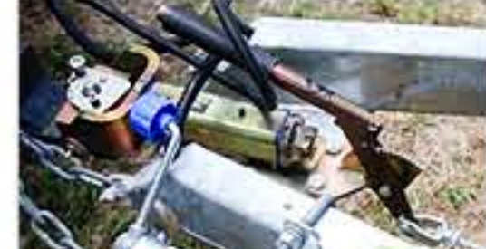
Vivamus accumsan mollis elit