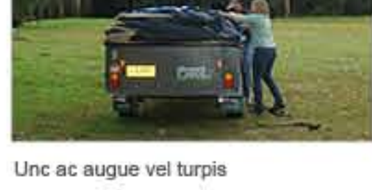
Unc ac augue vel turpis