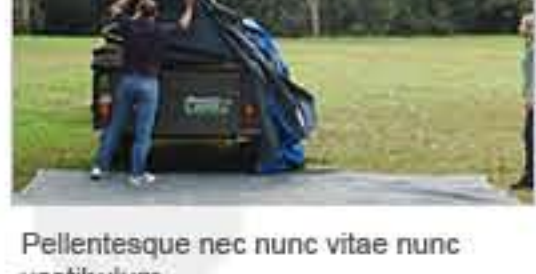
Pellentesque nec nunc vitae nunc vestibulum