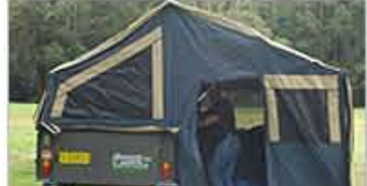
Pellentesque nec nunc vitae nunc vestibulum