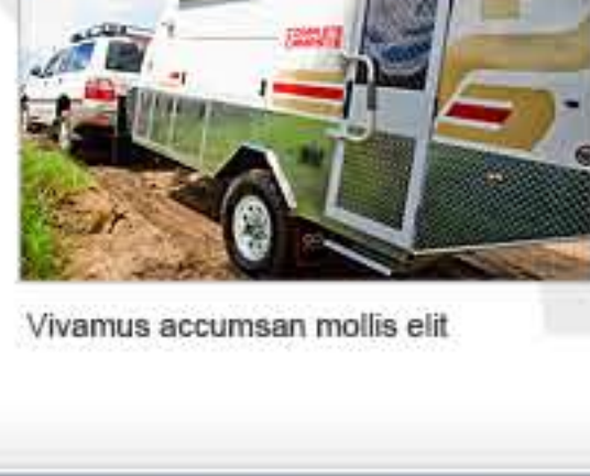
Vivamus accumsan mollis elit