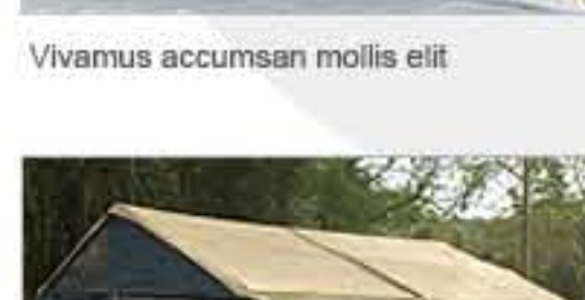
Vivamus accumsan mollis elit