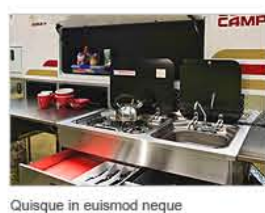
Quisque in euismod neque