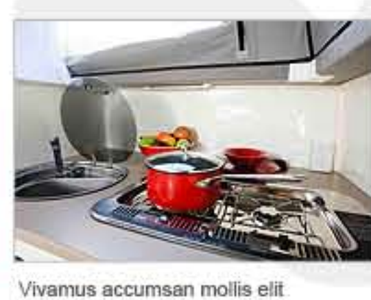
Vivamus accumsan mollis elit