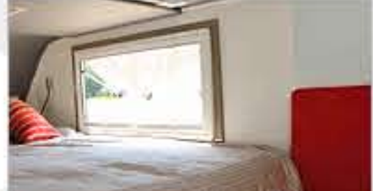
Pellentesque nec nunc vitae nunc vestibulum