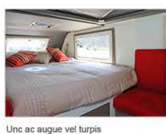
Unc ac augue vel turpis