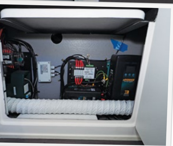
CLOCKWISE FROM ABOVE Electrics access; Compact kitchen at the rear; The add-on canvas ensuite is standard