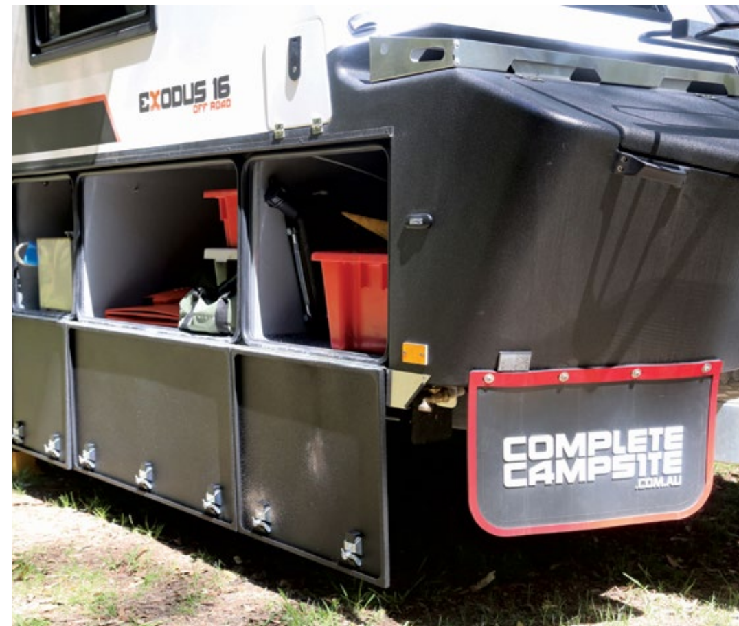
ABOVE AND BELOW Storage compartments and bike rack on the drawbar; Lots of external storage

The Exodus offers plenty of external storage for a 4.8m (15ft 9in) van. There are ample storage bins at the front and a drawbar storage box – more than enough for all the bits and pieces carried on a camping trip. The gas cylinders have a compartment within the drawbar box. One of the external bins contains a diesel-fired Webasto EVO5 Hydronic water heater. Instead of directly heating the water, the EVO5 has a glycol tank that heats water via a heat exchange. Innovatively, the EVO5 can have a fan heater attached, which can be used as a space heater.