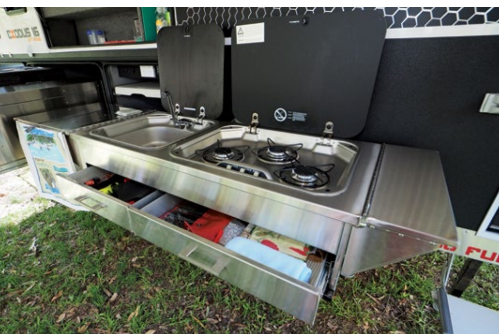
ABOVE AND BELOW The external kitchen was one of the attractions for Chris and Jan; Stainless-steel stovetop, sink, benches and drawers